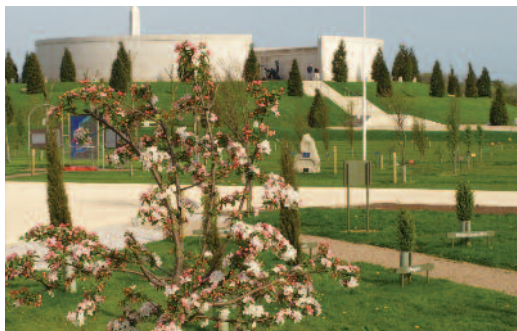
View over National Memorial Arboretum by NMA guide

We decided to repeat this event as it was so popular last time that we had many people who were unable to get on the trip.