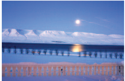
View from our hotel - Akureyri

Day three will see us make our way to the Myvatn area and we will visit Godafoss , (Waterfall of the Gods), Dimmaborg , (Dark City Lava stacks), Hverfjall , (an explosive crater), Krafla Geothermal Power Station and we end with a thermal dip in the Nature Baths before making our way to our 2 nd hotel by Myvatn Lake .