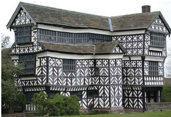
Little Moreton Hall