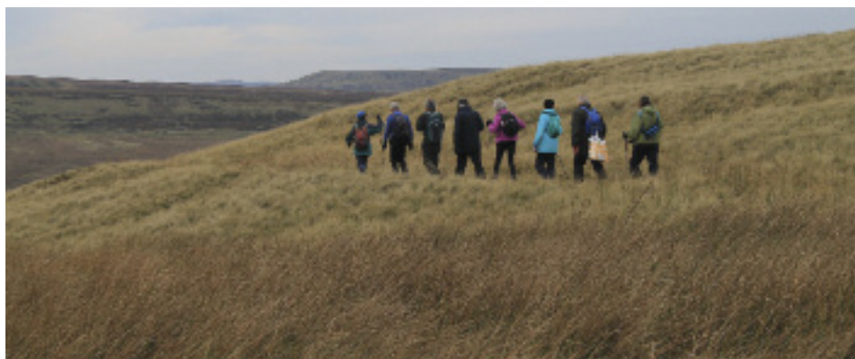
Walking Group NW striding out at Winscar

Walking Group NW recently enjoyed a walk at Winscar and Woodhead. It's always good to hear from our many and varied Groups and especially to receive photos of members enjoying taking part in their activities.