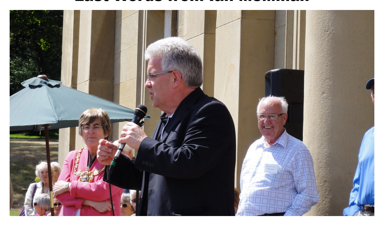
"I know you are all anxious to get to your naked fretwork class!"