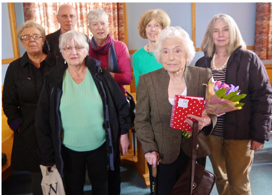
The meeting of the Literature Network

The Plague which was written in 1947 describes an Algerian town beset by rats that spread fear and then death amongst the native population. It was symbolic of the Nazi Occupation, indeed the Nazis were nick-named the Brown Plague by the French.