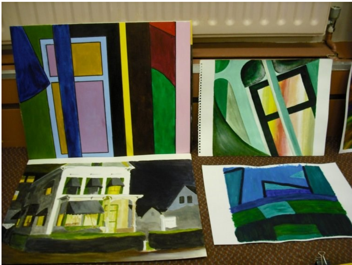
Some stunning work by the Group. See some more on their web page.