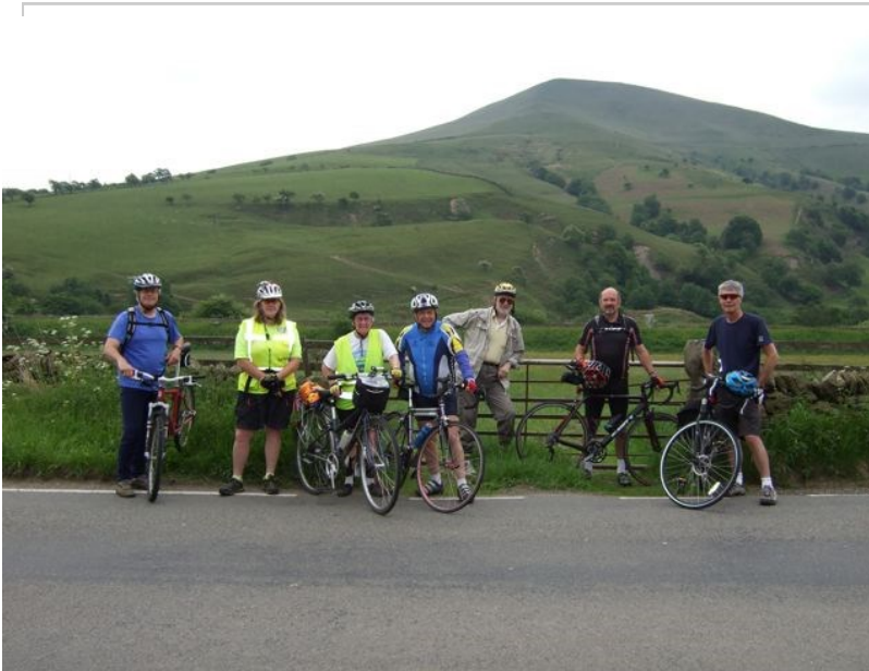
A lycra-free Group of cycling friends.

Since summer finally arrived, (am I tempting fate?), we have had four trips mixing leisurely flat rides, such as around the Ladybower and Derwent reservoirs and the canal and towpath trail of the Five Weirs with a more hilly ride up the Loxley Valley and off-road on the Trans-Pennine Trail.