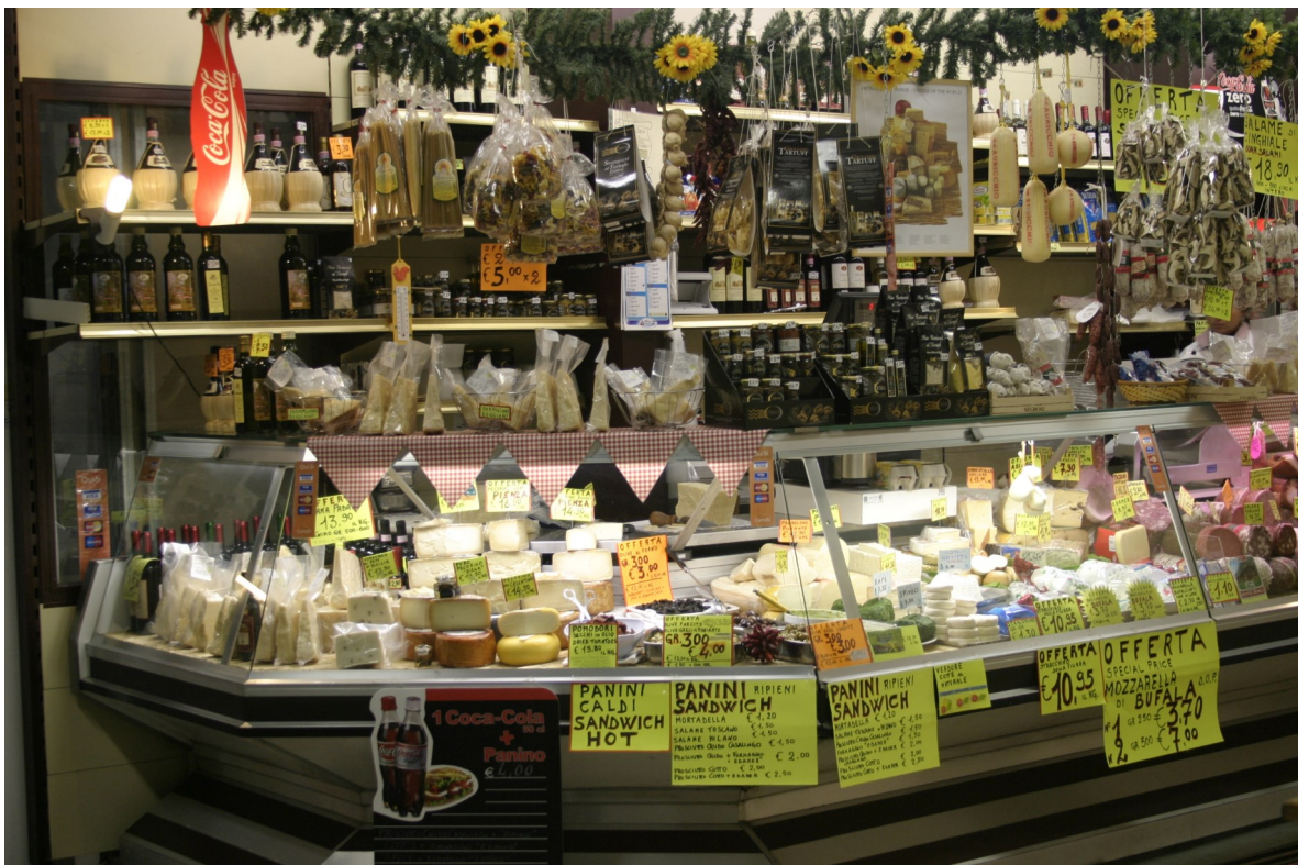
The covered market at Florence - a Tuscan delight

The cost is £670.00 . This includes coach to the airport, flights, transfers to hotel, half board, gratuities to airport driver, guides, tour manager and Italian driver. Single supplement is £79.00 . If you wish to join us, please complete the application form on page 32 and send £100.00 deposit made out to Appreciating Architecture to Shirley Marney.