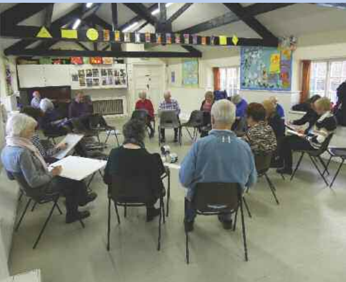
Art Group 2 at work 2017