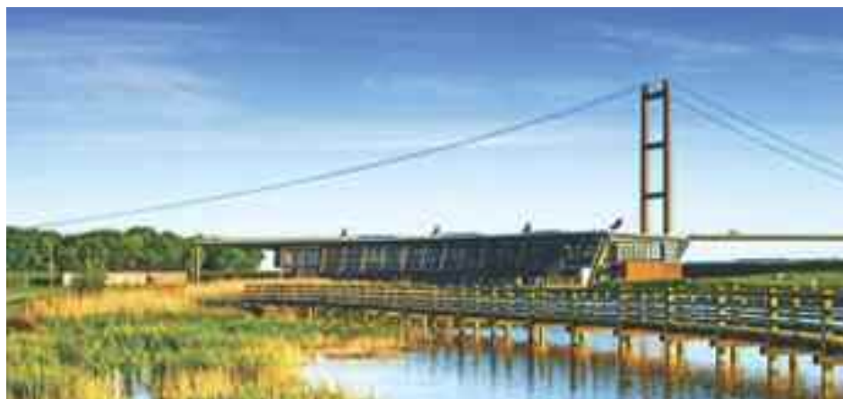
Water's Edge Visitors Centre, Barton-on-Humber