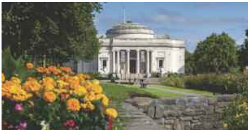
Lady Lever Art Gallery

In the afternoon, after lunch (included) we visit the Lady Lever Art Gallery, founded by William in memory of his wife, Lady Lever. Its newly refurbished South End Galleries are the result of a £2.8 million grant and well worth a visit. Explore the rest of the Gallery to see a major collection of Pre-Raphaelite paintings. Don't miss the "Sunlight Soap" paintings which began Lever's fascination with art.