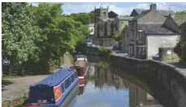
Skipton, Leeds/Liverpool Canal