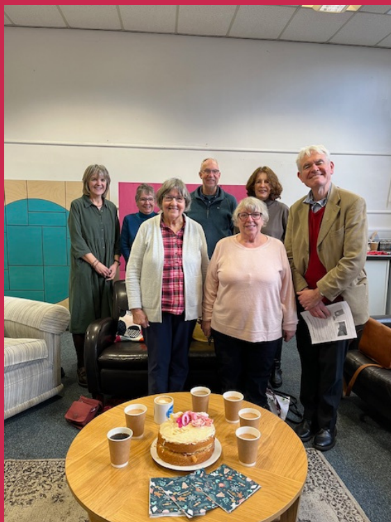
World of the Book - 10th anniversary