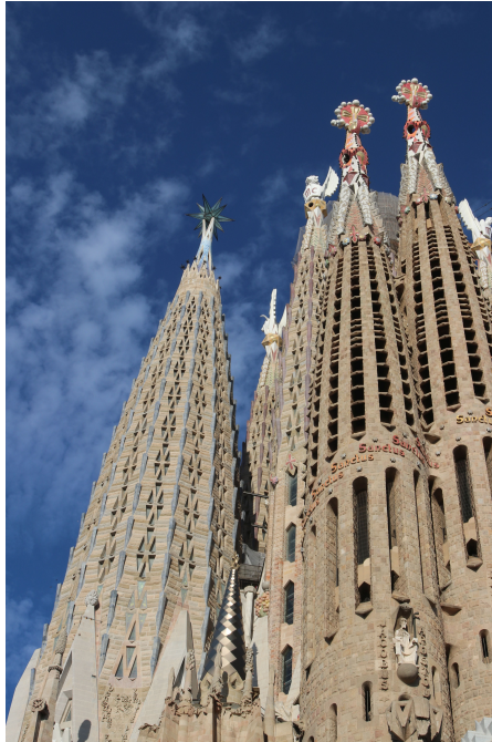
Gaudi's Cathedral, Barcelona

Gaudi's Barcelona – Derek Bacon The 'must see' architecture that puts Barcelona on everyone's bucket list.