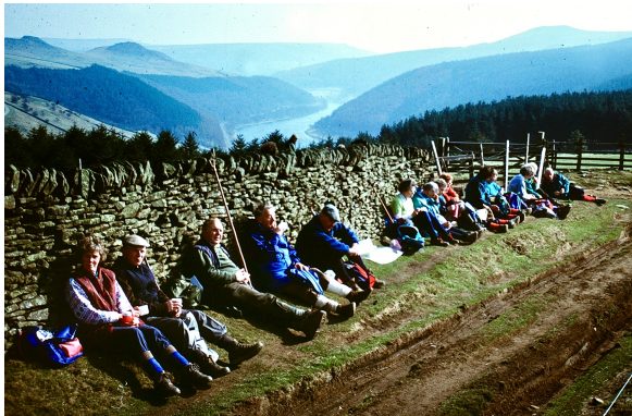
Photos of Walking Group A in the 1990s (more recent photos on the next page and on the cover)