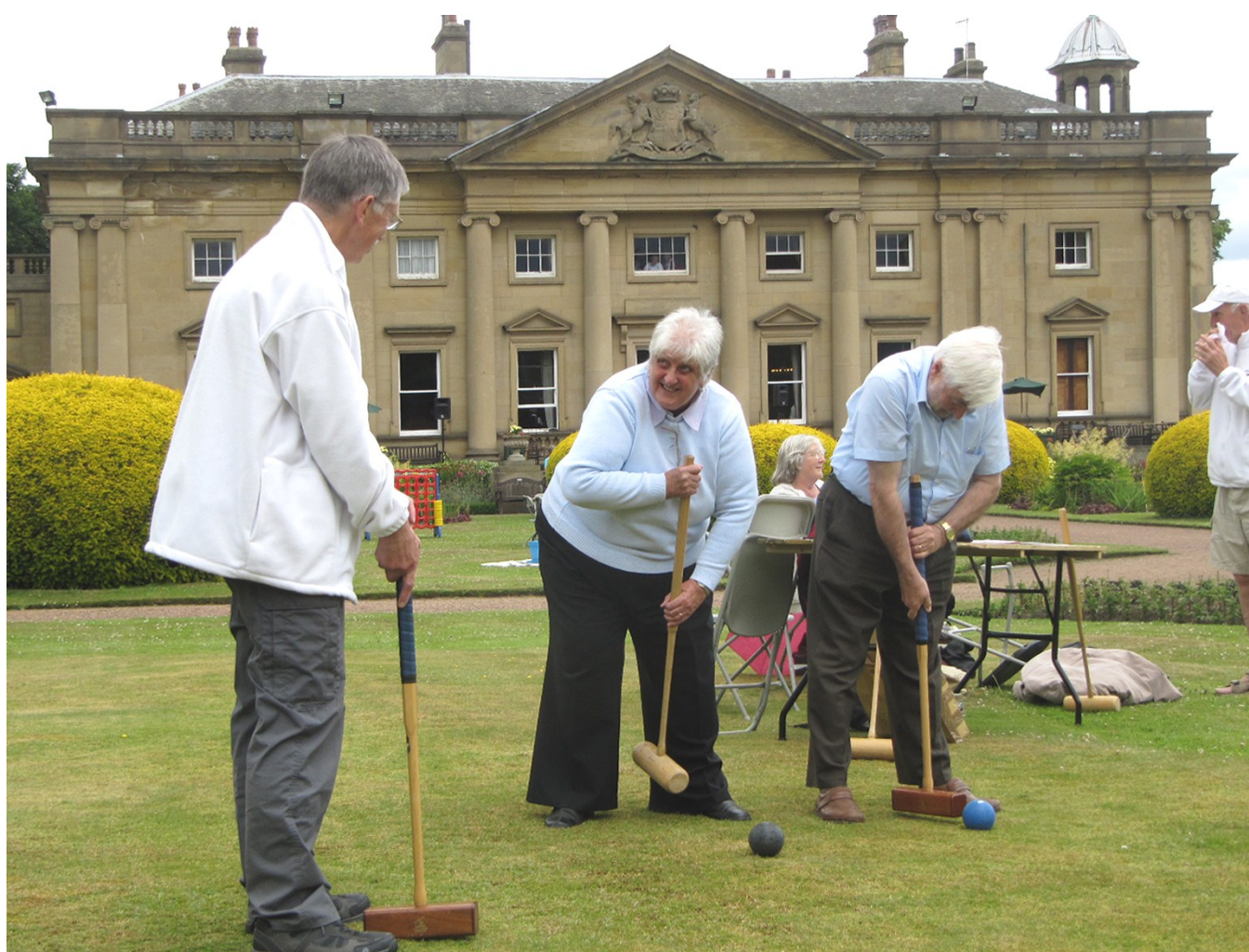
Fig 10: Croquet on the lawns of Wortley Hall

Outside on the lawns draughts, chess, bowls and croquet proved highly popular; whilst over at Wortley Church 80 people excitedly awaited a talk on local history, followed by a short ramble back to the Hall.