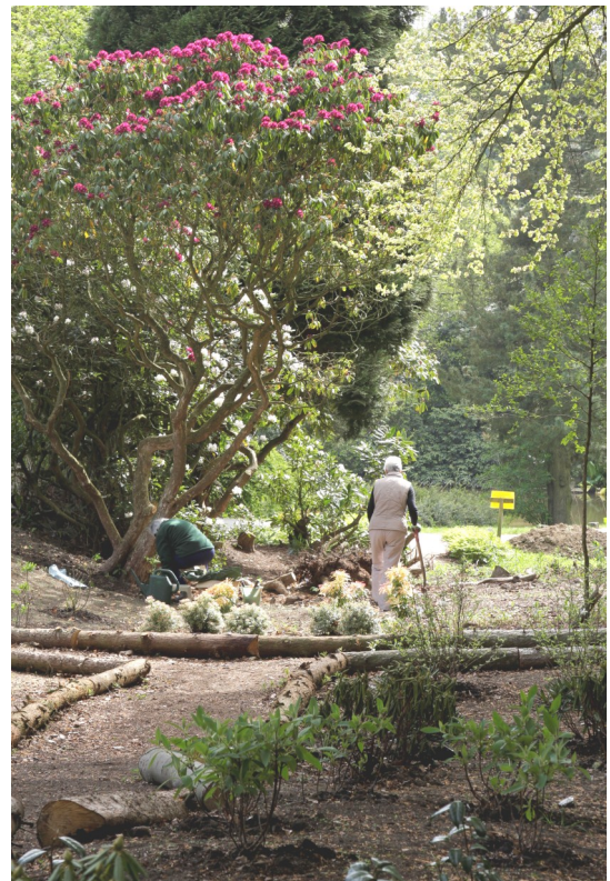
Fig 9: The Commemorative Garden

In May a long slim boat sat in the sun. Passengers were checked on board and by mid-afternoon they were away, gliding from Sheffield canal basin for a trip along the waterway. There was a relaxed festive atmosphere, with a bar at one end, and cream teas at Tinsley Locks. Some passengers climbed