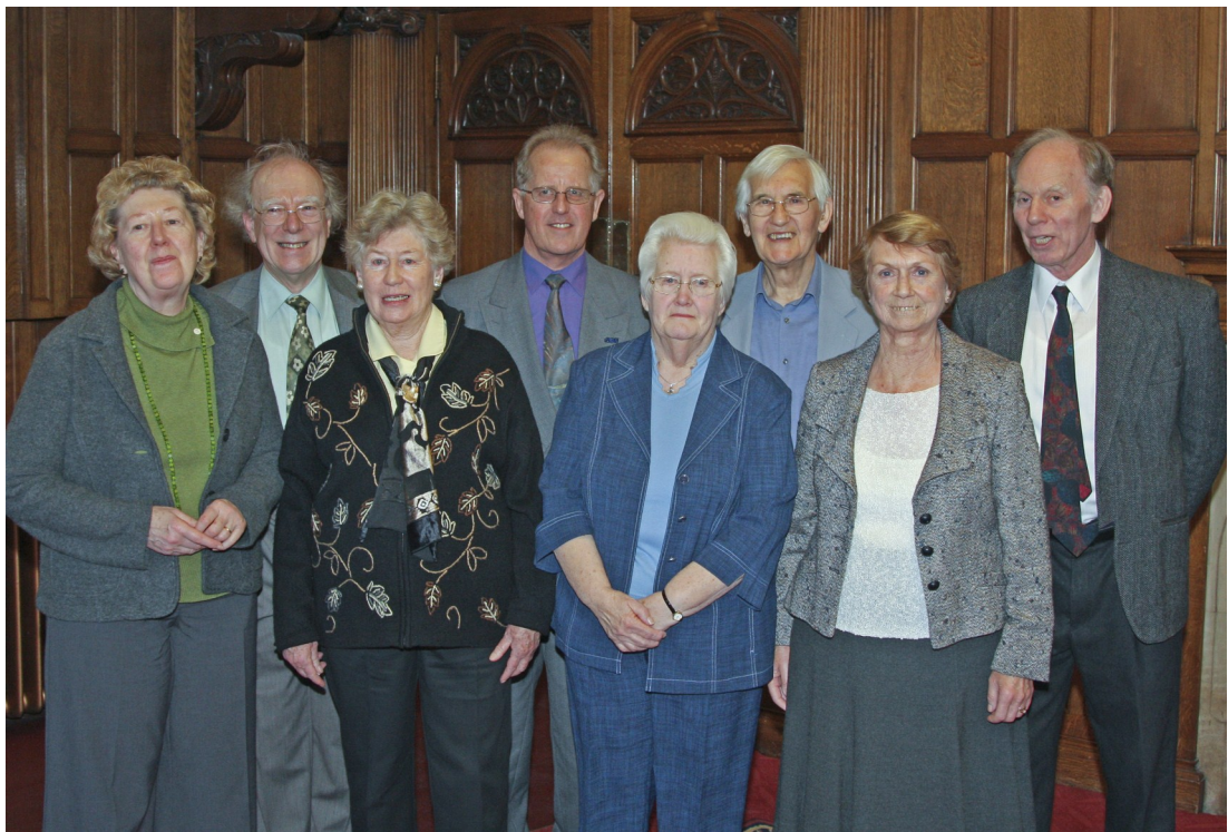
Fig 8: Past and present General Coordinators pictured at the Civic Reception held to mark the 25 th anniversary of Sheffield U3A

Sheffield, City on the Move, has one of the largest U3As in the United Kingdom. Since its inception in 1986, membership has steadily increased and the number of Groups has multiplied accordingly. This is due to the dedication of many volunteers, not least of all the General Coordinators, who have taken day to day responsibility for Group development and wellbeing.