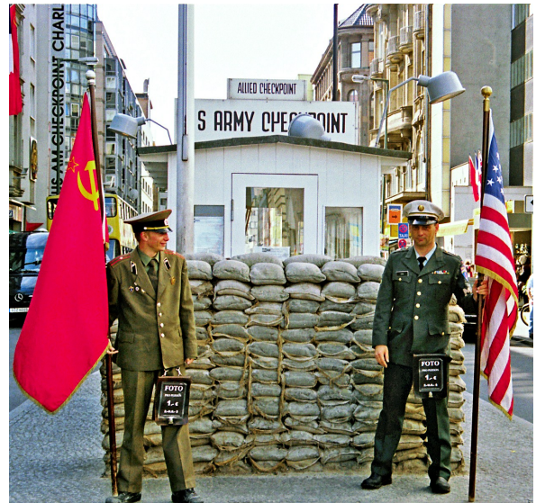
Fig 6: Berlin 2008