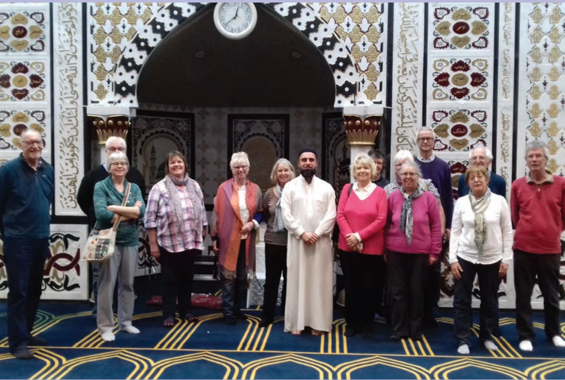
Steel City Wanderers guided tour of the Sheffield Islamic Centre