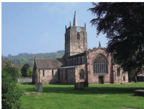
St Mary Wirksworth