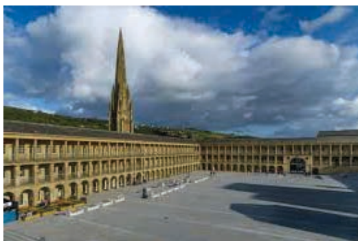
The Piece Hall, Halifax

The cost per person for this visit is £17.60 , which covers coach travel, gratuities and the guide's fee. No refreshments are included. To apply for a place, please complete the booking form on page 38 and send it with your cheque and small sae to Margaret Bullivant as soon as possible.