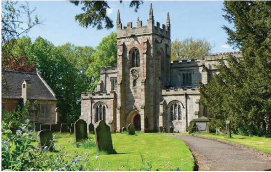
St Mary and St Barlok Norbury