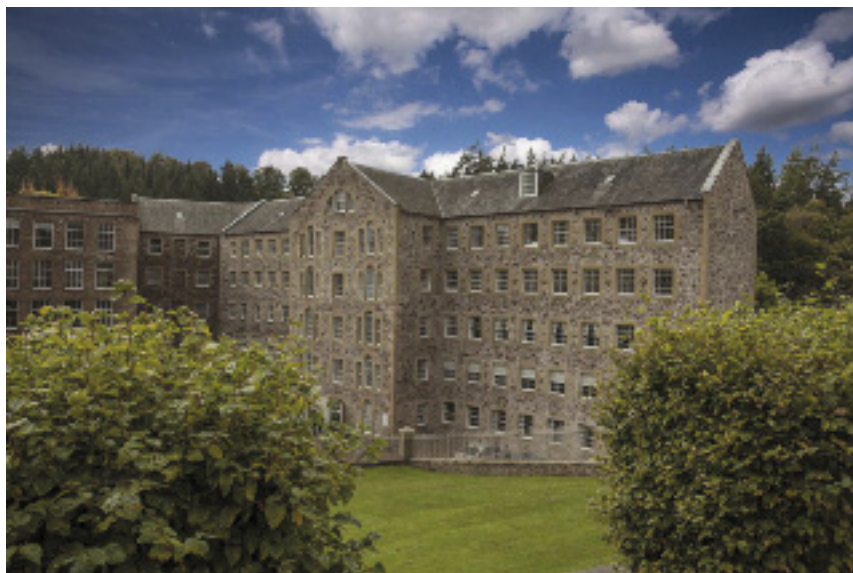
New Lanark Mill Hotel

To reserve a place please complete the booking form on page 39 and send it with a deposit of £50 per person and a Links sized (22x16cm) sae to Margaret Langrish as soon as possible.