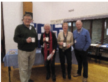
Some of our volunteers