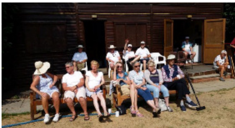
Players enjoying the sun and a cuppa