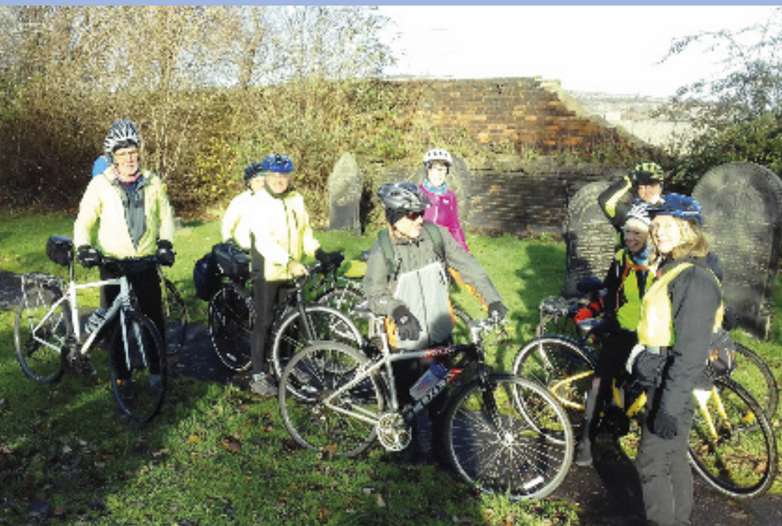
SU3A Cycle Group winter cemetery ride