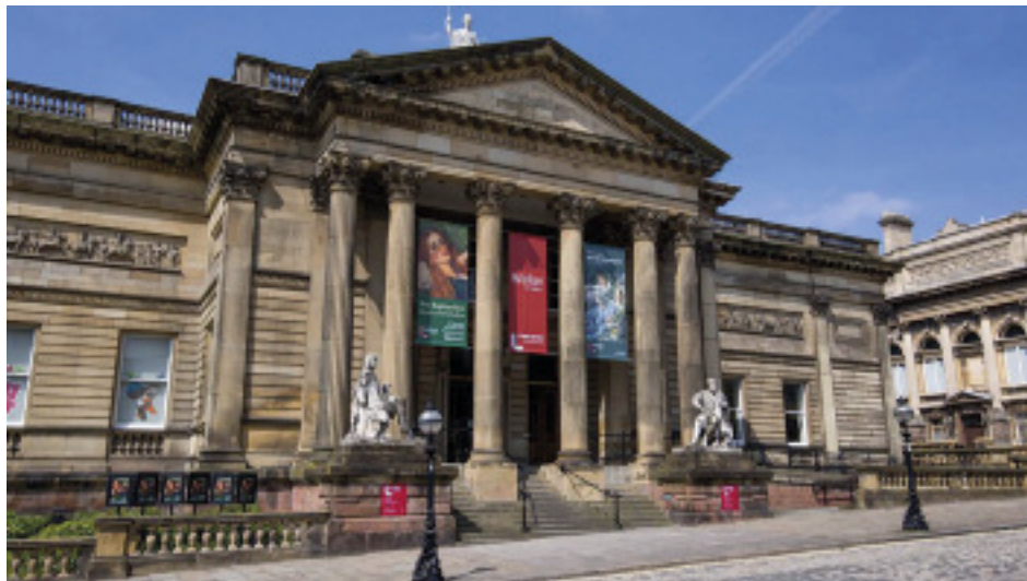
Walker Art Gallery