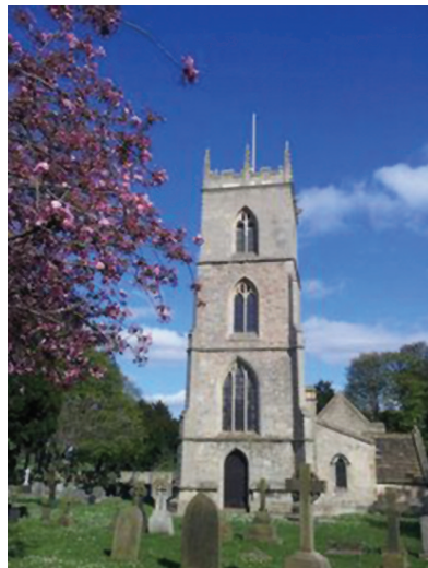
St Katherine's, Loversall

Wadworth, St. John the Baptist is of late Norman construction which stands on a high point in the village with a 15th century tower. In the 15th century the Fitzwilliam family settled here, and their two fine tombs bear witness to their powerful presence. There are sacred medieval effigies, a fascinating south porch, roof bosses and lovely stained glass.