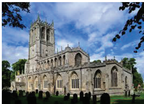
St Mary's, Tickhill

Tickhill, St. Mary is again of Norman origin, but with a Jacobean pulpit and a highly decorated medieval chest. It is regarded as one of the finest medieval churches in Yorkshire.