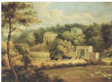
The cemetery in the 1830s, seen from Ecclesall Road

A Listed Grade II* landscape, the General Cemetery is one of Sheffield's finest historic assets. One of Britain's first commercial cemeteries, it opened in 1836 with a dramatic design in a "remote and undisturbed location". After its fashionable Victorian heyday – Mark Firth and the Cole Brothers were buried there – its fortunes declined in the twentieth century. Overgrown and derelict it was taken over by the City Council in the 1970s to establish much needed public open space in the Sharrow area. The Friends Group was formed in 1989 and its work continues as the Sheffield General Cemetery Trust with guided tours, events, research, landscape maintenance and building restoration.