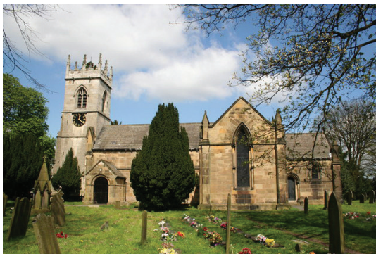
St Michael, Rossington