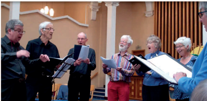
The joy of singing with the A Cappella group.