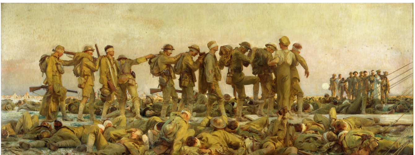
'Gassed' by John Singer Sargent on show at the Imperial War Museum