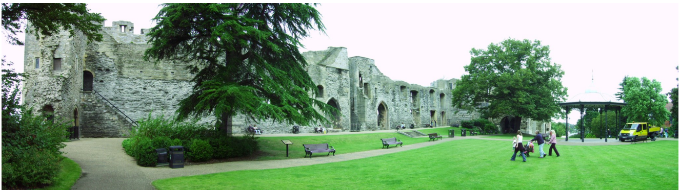
Newark Castle. Not on the itinerary but a nice picture

Please ring Dot Sutcliffe on (0114) 268 5918 for further information.