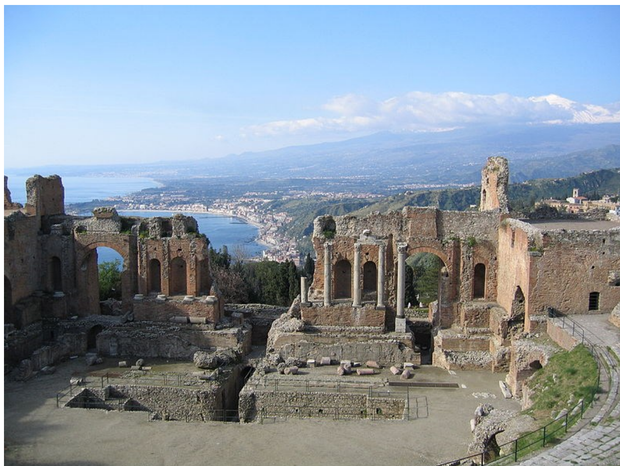
Visit Sicily with the European Travel Group and see the Greek theatre at Taormina