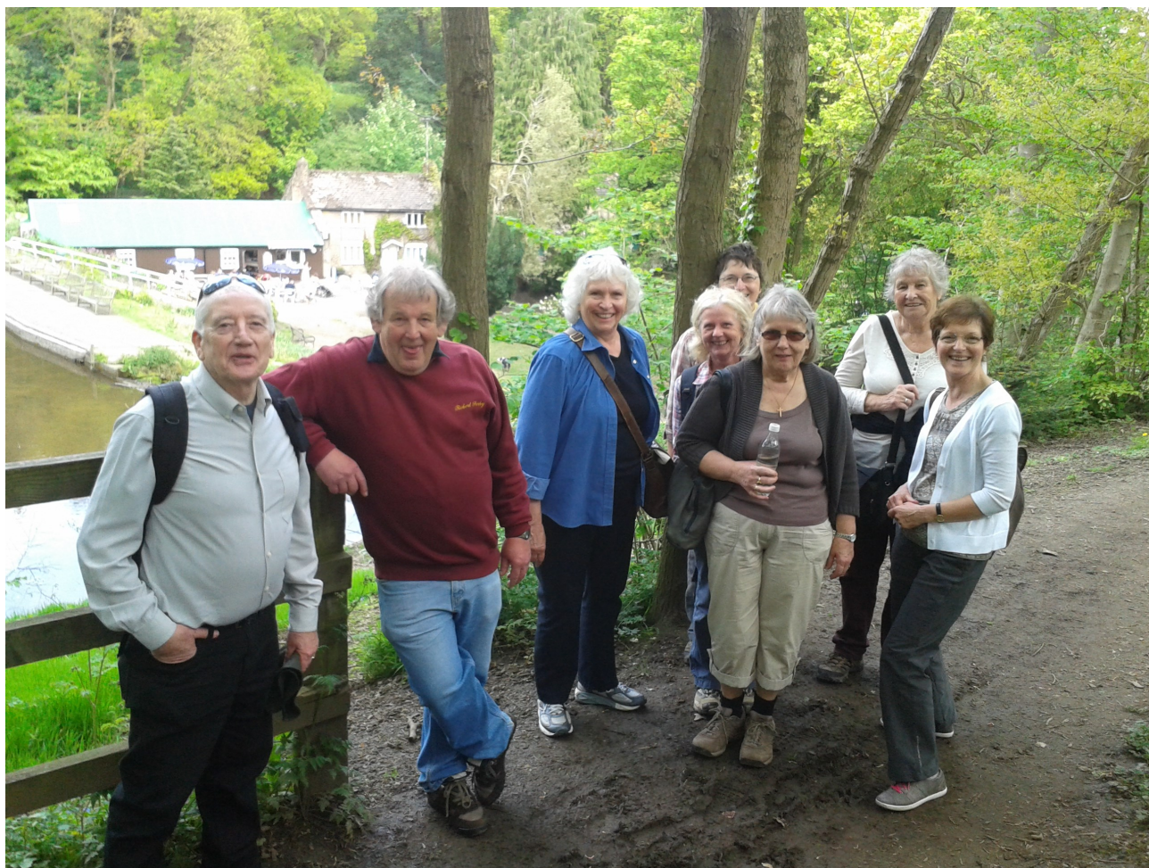
Members of German Walk'n'talk at Forge Dam