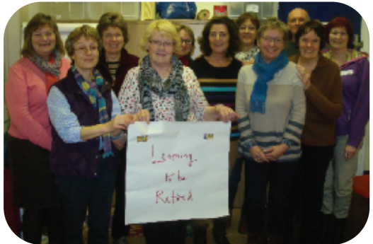
Participants on the autumn 2015 course

Learning to Be Retired is running again in October/November 2016. Places limited to 12 per course. For more details contact: