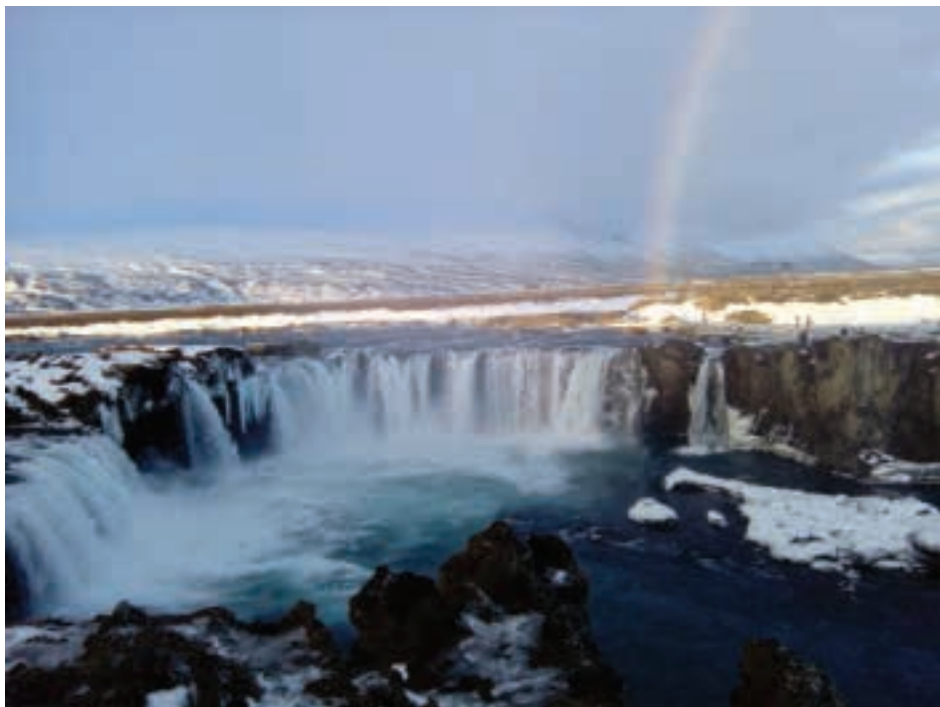
Godafoss, Waterfall of the Gods

“didn’t realise until I got home how tired I was and looking back amazed at how much we fitted in during our short stay in a sometimes bleak, but majestic country”