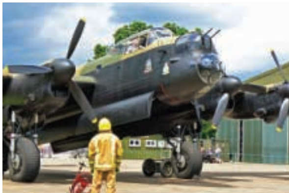
Avro Lancaster Bomber

The inclusive cost for the day (coach travel, guided museum tour and gratuities) is £23.50 per person ( £17.50 for NT members). Lunch is not included, but there is a good restaurant at the airfield, offering meals and refreshments. To reserve a place, please complete the application form on page 38 and send it, with a cheque and a small s.a.e., to Derek Shipley as soon as possible.