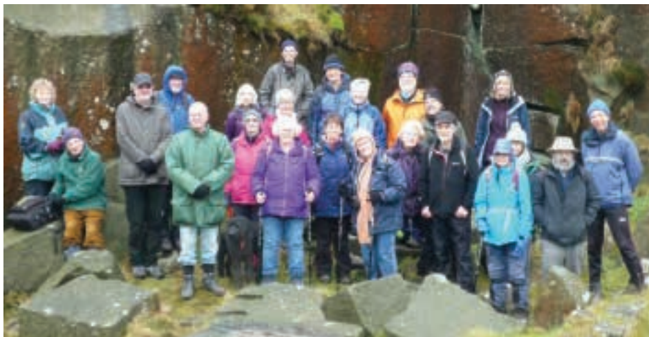
Geology Group in Burbage Valley

Remember! Copy deadline for the June 2017 Links is 28 April 2017