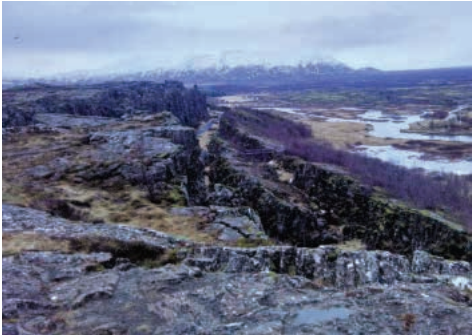
Thingvellir National Park

When we first advertised this trip in April 2016 we had almost double the number of applicants we could actually take with us. The European Travel Group promised to those disappointed that we would, if at all possible, try and arrange a second trip for 2018.