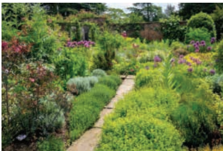
Gunby Hall Gardens

The inclusive cost for the day (coach travel, guided museum tour and gratuities) is £23.50 per person ( £17.50 for NT members). Lunch is not included, but there is a good restaurant at the airfield, offering meals and refreshments. To reserve a place, please complete the application form on page 38 and send it, with a cheque and a small s.a.e., to Derek Shipley as soon as possible.