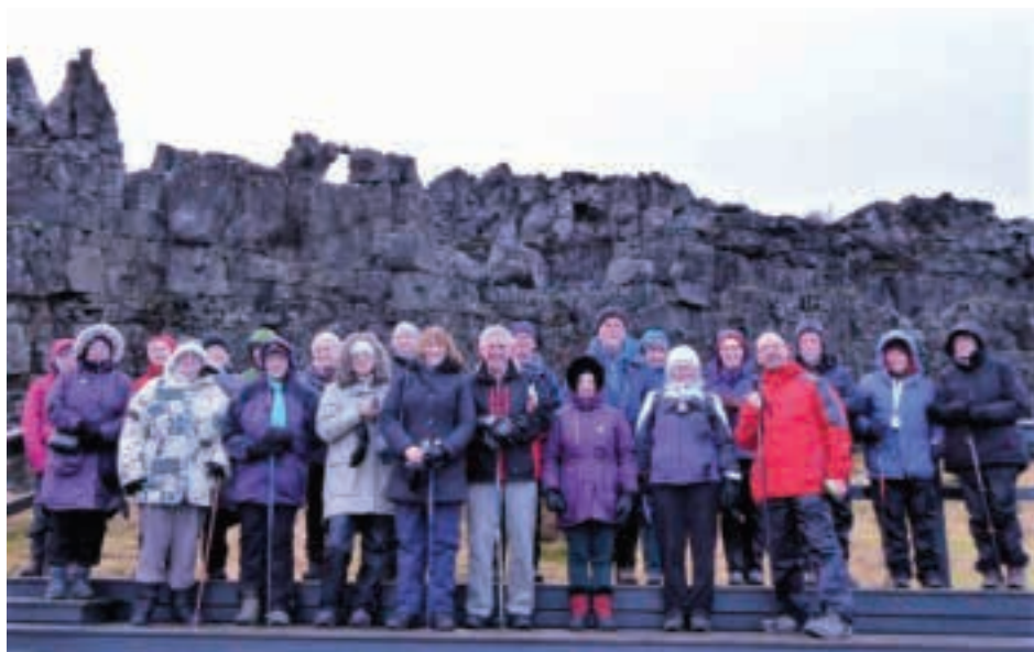
Thingvellir, Iceland – February 2017

In the meantime, instead of an application form for the second trip, we have included in this notice some photos and comments received from the travellers on the recent trip. More photos and video clips can be found on our website.