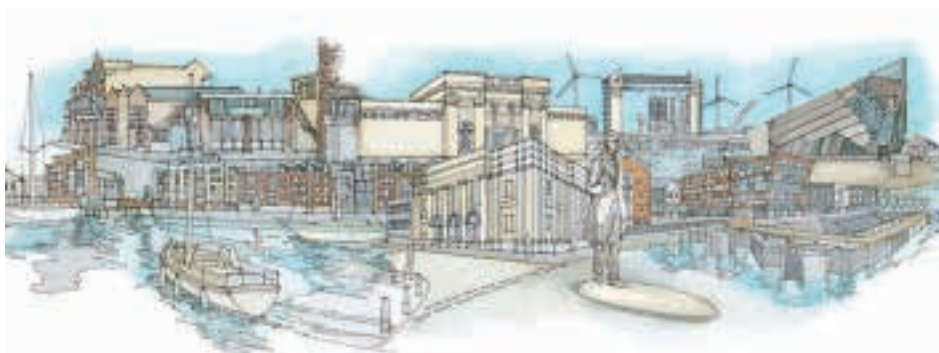
Hull City of Culture 2017

To apply for a place on this visit, please complete the booking form on page 34 and send it with a cheque and small s.a.e. to Margaret Bullivant as soon as possible.