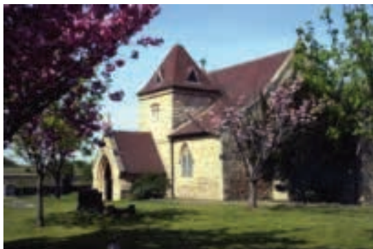
St Oswalds Kirk Sandall

We hope to arrive at Barnby Dun St Peter and St Paul church for lunch at 12.30 pm. The church is of 14th century origin with its carved heads, gargoyles and 19th century stained glass and tiles. The tower dates from the 15th century, as do the font, the sedilia and piscina.