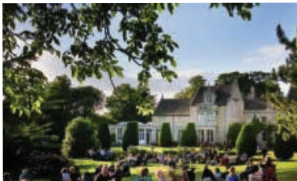
Toilethorpe Hall Stamford