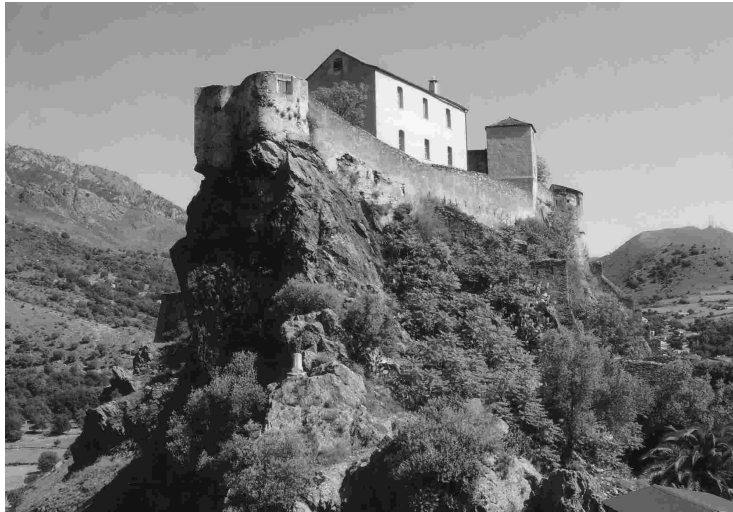
Citadel at Corte, Corsica