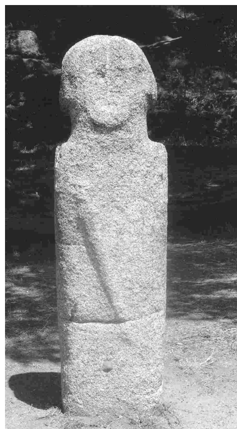
Menhir in Corsica