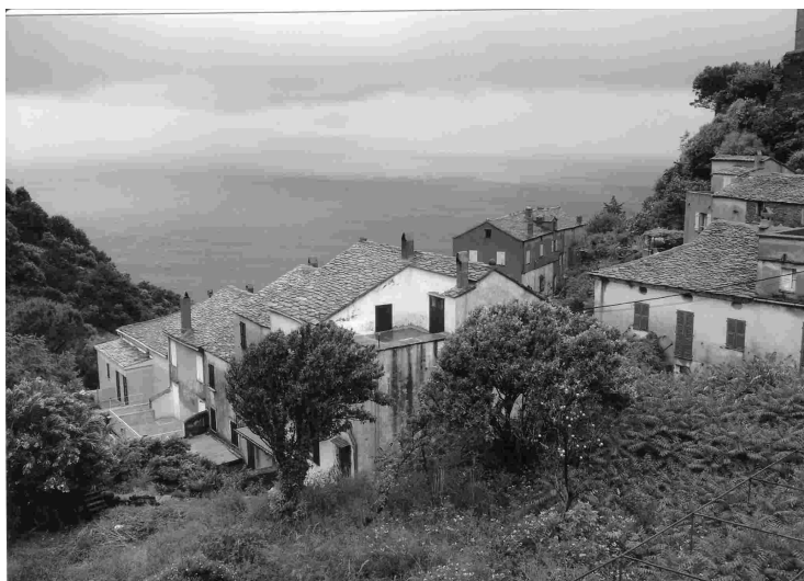
Cap Corse, Corsica

A holiday of contrasts. Corsica's jagged mountains of pink and grey granite dominate the island. A light covering of snow emphasised their beauty. Lower down, the slopes were covered in the dense shrubs of the maquis sparkling everywhere with the white flowers of various types of cistus. Steep winding roads gave us an ever changing scene as we travelled the length of the island.