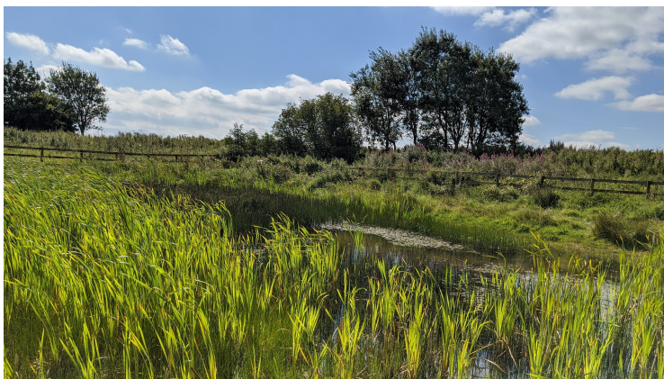
Taddington Mere

Email your thoughts to the Editor at links at su3a.org.uk