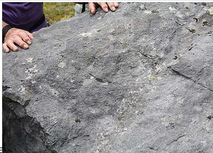
PAUL LOOKING ON ASKANCE

PAULINE'S HANDS MAKE A USEFUL SCALE TO SHOW OFF THE COLONIAL CORAL CALLED