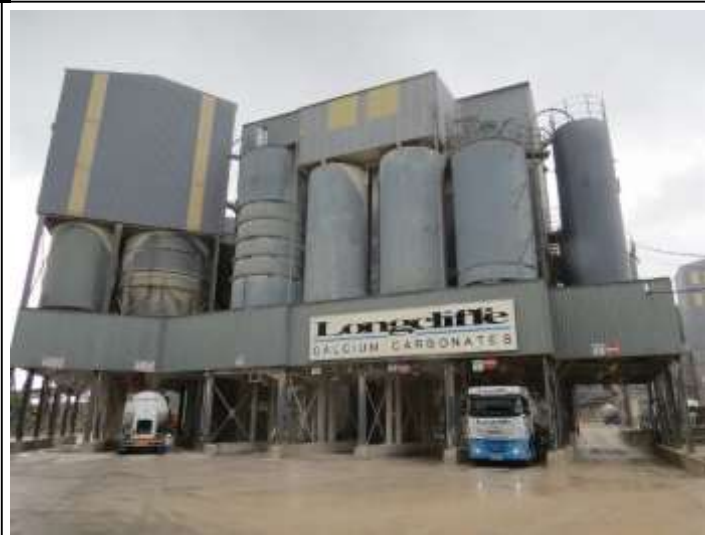
LORRIES FILLING UP POWDERED