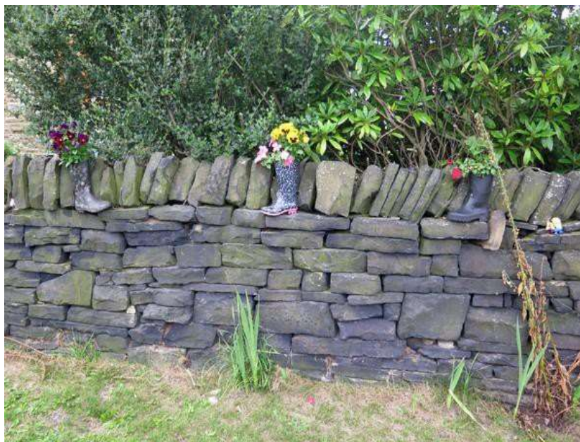
An example of dry stone walling in the Greenmoor Rock

The village of Green Moor was once famous for the production of vast amounts of paving stone – an industry that was at its height during the 19 th century and which was in such great demand in London that it had its own Greenmoor Wharf in Southwark named after it; however, all quarrying activities ceased in 1936 and very many of the quarries have since been infilled.