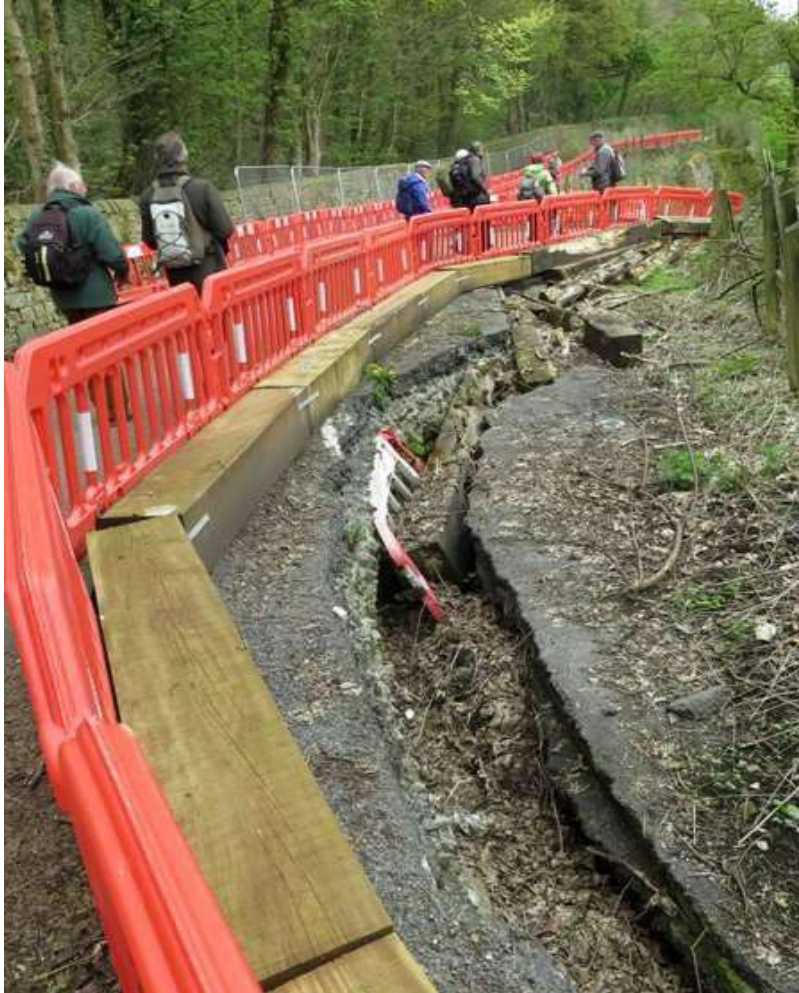
Landslip in the last year.

by Peter who then was muscled out of the queue to be left with none for himself! Then on to see the effects of the landslip on the Eyam to Grindleford road. The slope here is mobile as it is on the Edale shale – a weak and fractured rock on a steep slope. Locals say this road will never reopen.