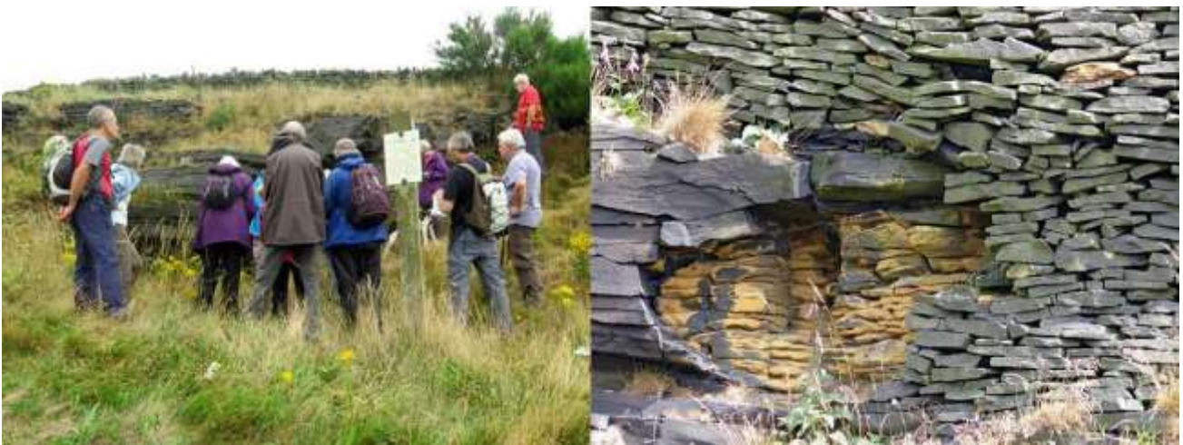
Differential weathering and a fine example of dry stone walling at Don Hill Height quarries

Moving on to the old road stone quarries at Don Hill Height, the views here are very impressive. The escarpment slopes down to the valley bottom, in which Stocksbridge is set, and the Millstone Grit moors can be seen in the distance.