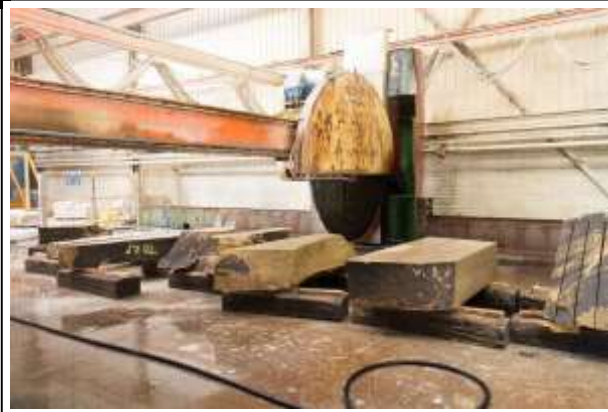
TEN FOOT DIAMETER DIAMOND TIPPED SAW