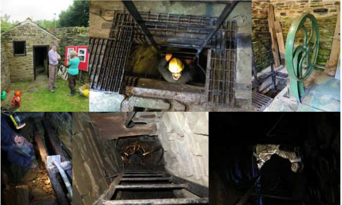
Exploring the Old Pump House at Green Moor

We finished off our walk at Ivy Millennium Green, where the most hardy members of the Group were able to sit down and eat their packed lunches, before some of us took advantage of a unique opportunity - provided by Barry Tylee - to explore the Old Pump House, which was once used to provide essential water to the village of Green Moor.