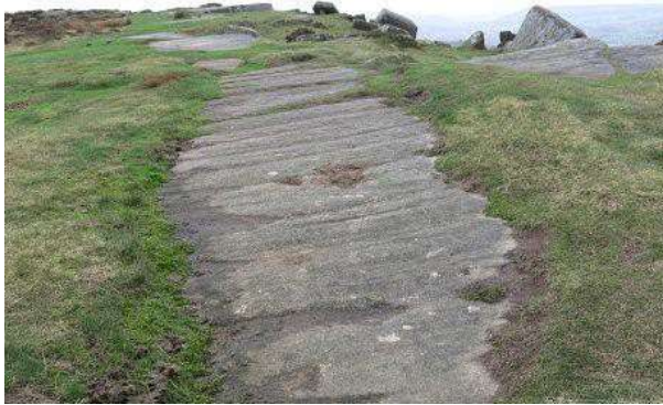
RIPPLE MARKS – A SEDIMENTARY