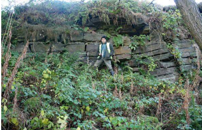
The Green Moor Delph RIGS in 2011

Walking back towards Green Moor village, all of us enjoyed seeing the black Hebridean Sheep in the adjacent field, where the boundary wall here is constructed with massive blocks of Greenmoor Rock. After a few moans about the fact that we had not stopped for lunch by now, a short detour led us to the remains of an old track, which would have taken stone from the Isle Skye quarry down to the bottom of the hill – to the River Don - where its journey to London and other places would have started.