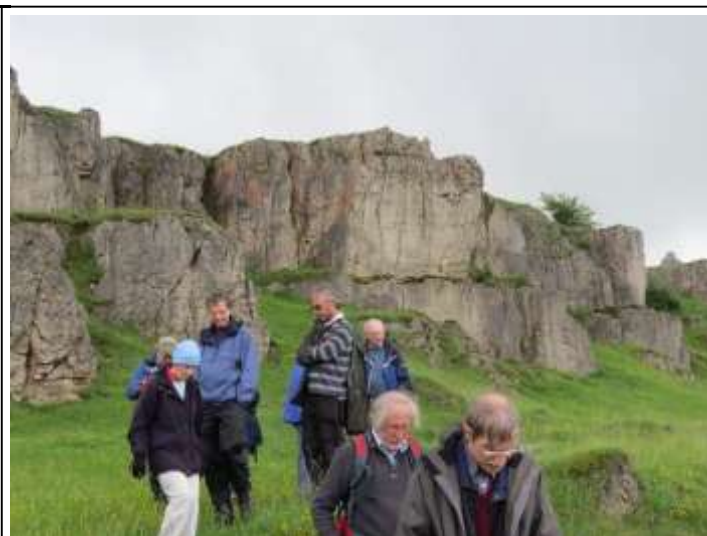
DESCENDING FROM HARBOROUGH