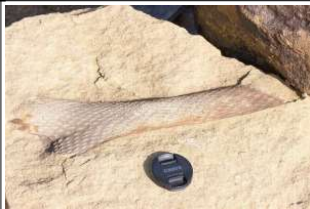
FOSSIL TREE STEM IN THE QUARRY

Maintaining the U3A Geology tradition, we retired to the nearby (appropriately named) Sands Inn for refreshments, before the drive back home.