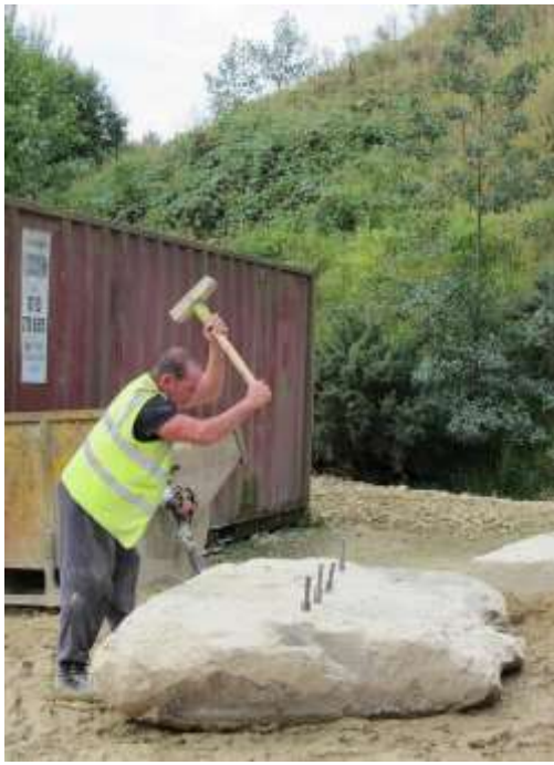
STONE BLOCK BEING SPLIT BY PLUG & FEATHER