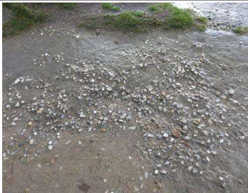
PEBBLES LAYERS WHICH

her sidekick, until she caught up. It was a very blustery day and we were intent on exploring this Millstone Grit edge.