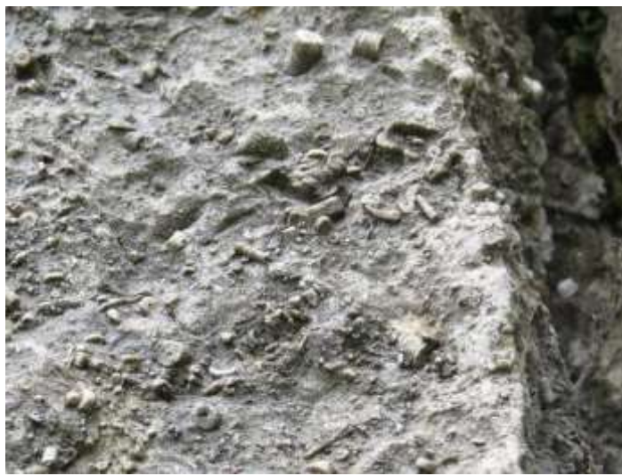
FRAGMENTS OF FOSSIL CRINOIDS

Dolomitisation is the introduction of magnesium into the calcite molecule. The growth of these dolomite crystals replaces calcite grains. This process destroys most fossils if they were present so the fossils in the picture above cannot be in dolomitic limestone. Magnesium rich fluids percolated in the past through joints and weaknesses and were absorbed by adjacent limestone. The question is where did these come from? In the past we thought they came from overlying Permo-Triassic rocks since eroded. Peter was able to update us on the latest idea which is that they came from underlying older rocks – mainly shales – from the south. The jury is out on this!! Isn't it complicated!!