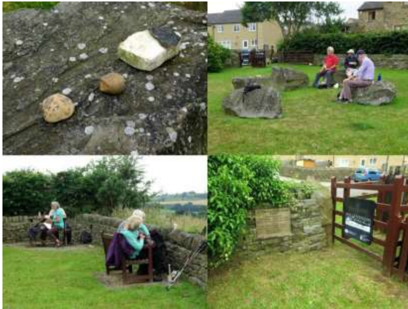
Finishing the walk around Green Moor at Ivy Millennium Green