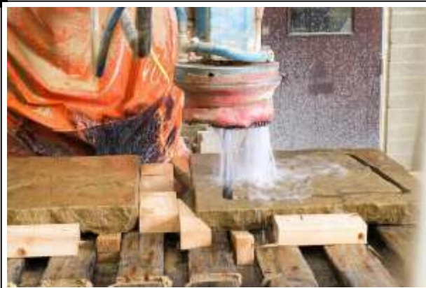
ROBOT STONE CUTTER IN ACTION