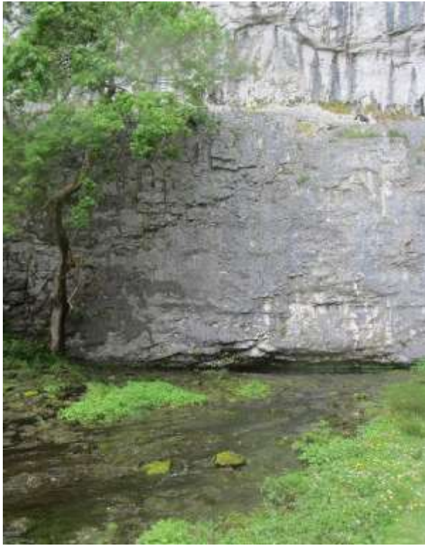
VAUCLUSIAN SPRING; FOOT OF THE COVE