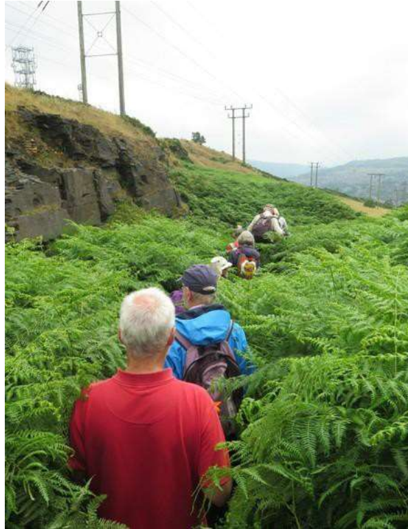
Battling through the bracken at Don Hill Height

geomorphology that had been provided earlier in the walk, Paul then gave us an excellent explanation of the landscape that was presented before us. Greenmoor rock, being sandstone, is acidic and provides an ideal habitat for bracken and gorse and contrasts strongly with the vegetation that grows on the shale.