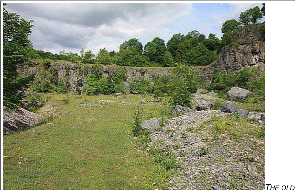
DRESSING FLOOR OF THE QUARRY. BEDDING PLANES SEEN IN THE QUARRY WALLS

On a beautiful hot sunny day in August, 17 or so SU3A geology group stalwarts set off from the former Midland Railway Station at Millers Dale (completed in 1863) to explore yet more Limestone of the Peak District, of the Dinantian Epoch - a sub division of the Carboniferous period about 330 million years ago when this part of the UK lay in a sub tropical zone with a shallow sea. This area of the Wye valley is referred to as what?? We walked to the old East Buxton Limestone Quarry, now a nature reserve to view evidence of rising and falling sea levels. What was this evidence? plus fossils of coral and various shell creatures.