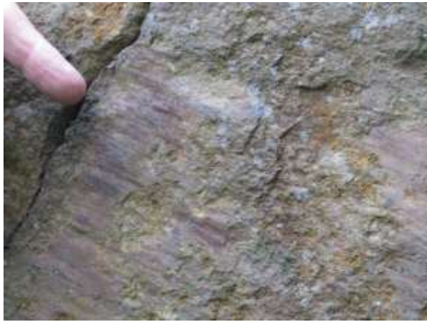
THE SMOOTHER SURFACE HERE SHOWS THE