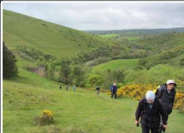
CLIMBING ECTON HILL FROM THE

where a Boulton and Watt steam engine was installed in 1788 to raise the kibles full of copper ore to the surface from shafts as deep as 300m below ground. The engine house was open for a study group and we were invited inside to see the huge wheel. Close to the main shaft is an artificial mound where another shaft was sunk so that a counterweight could descend to assist the engine when raising heavy loads of copper. The copper was sent to Denby for smelting into brass for various purposes but some was sent to Derby to be rolled into copper plate to protect the hulls of sailing ships in the navy against borer worms. A copper-bottomed guarantee! It was estimated that the Duke of Devonshire profited to the tune of £300,000 from this mine, enough to build the Crescent at Buxton and to pay his wife's gambling debts.