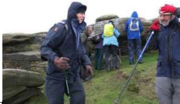
STRUCTURE FORMED ON AN ANCIENT BEACH