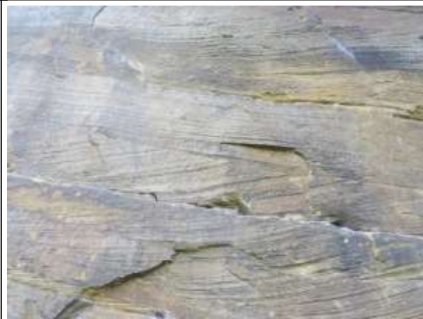
A CLOSER LOOK AT THE CROSS BEDDING