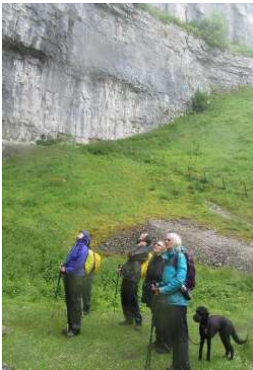
LOOKING UP AT THE CLIFFS