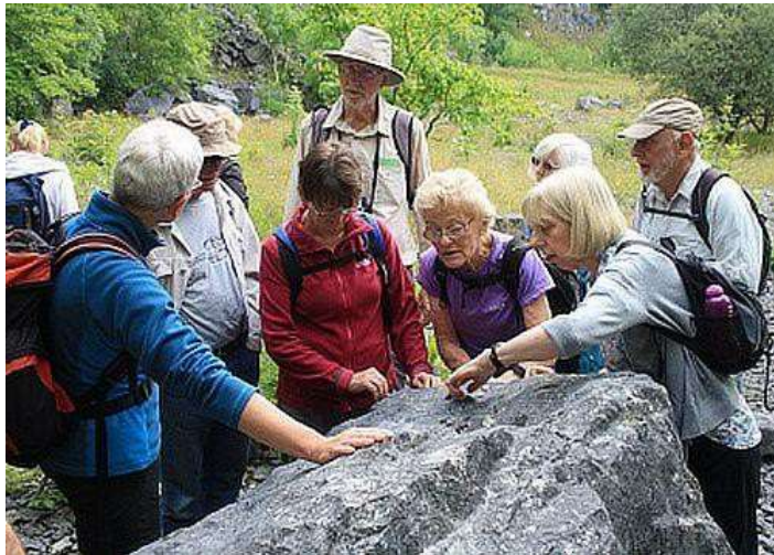
THREE 'KEENIES' LOOKING AT THE