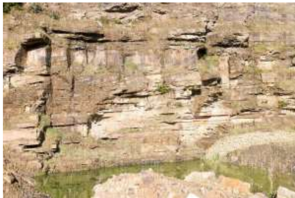
TYPICAL QUARRY FACE: DIFFERENT TYPES

Tim looking into a vug and giving it some thought! Can he see some minerals in the holes? Note in this, and the previous picture, the absence of bedding planes. The rock reacted only very slightly with HCl.