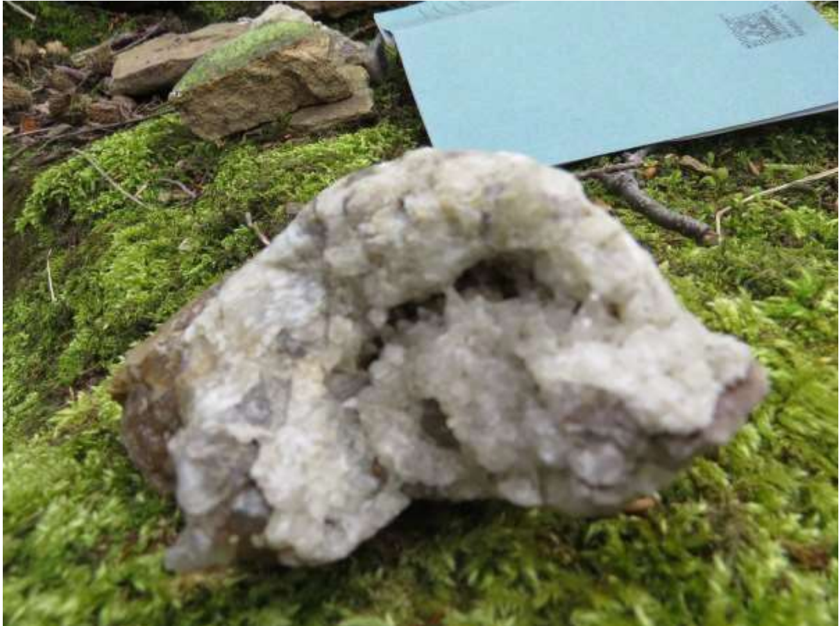
Vug allowing crystals to grow

At the road junction close to Monpesson's Well is the tip from Shaw Engine Mine. We scratched around in the tip and found various rocks and minerals through which the shaft had passed - some Carboniferous limestone, calcite ( both of which reacted to HCl acid ), barytes and quartz. A nice vug was picked up by David – a gap in the rock which allowed hot fluids to cool and crystallise to show good crystal shapes. These were probably shapes called dog tooth spar.