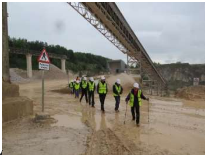
LIMESTONE FOR DISTRIBUTION