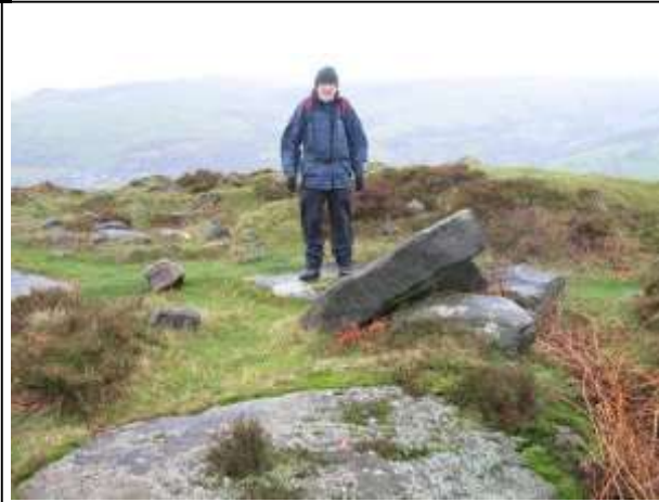
LARGE STONES THAT ONCE FORMED A CIST

(STONE LINED GRAVE) IN THE CENTRE OF A LARGE BURIAL MOUND DATING FROM THE