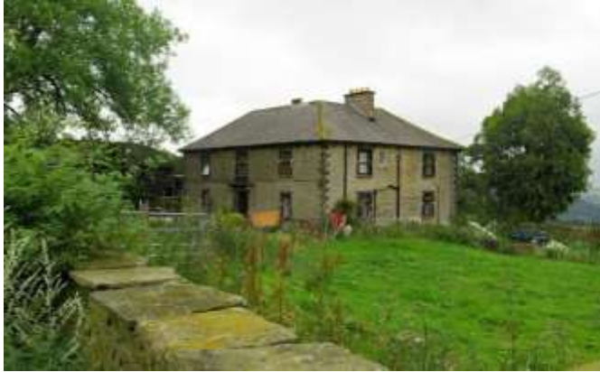
Greenmoor Rock and Welsh slate at Hunshelf Hall

We paused outside Hunshelf Hall – dated c.1746 - where there are several fine Eucalyptus trees and the Greenmoor Rock contrasts strongly with the Welsh slate that has been used to re-roof it a century later.