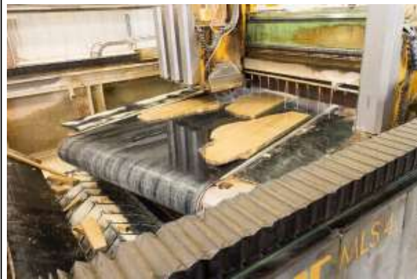
COMPUTER CONTROLLED STONE CUTTER

Near the end of the tour, we were impressed by the latest technology: computer controlled stone cutters and laser-guided robotic cutters. These high-tech machines are programmed and operated by trained stone masons. The robots can cut stone in 3-D, to produce amazing structures, such as the stone planters/seats in Tudor Square, Sheffield. It was good to see the company investing in the future: we met two of the three apprentices, learning the traditional skills of the stone masons and quarrymen, and applying those skills through the latest computer technology.