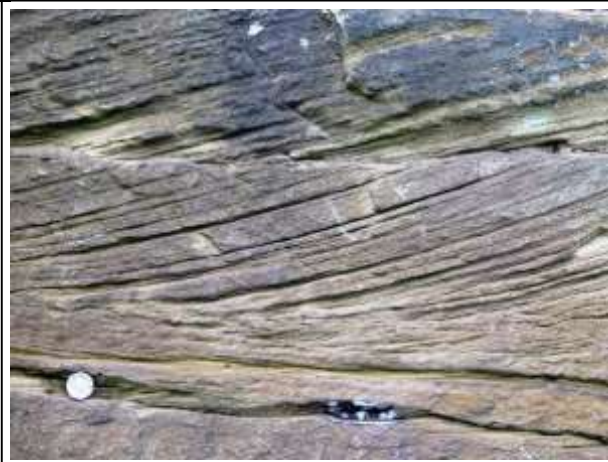
AN EVEN CLOSER LOOK

The rock here is fine –grained so the water in which it was deposited will not have been moving too rapidly. It also showed flakes of mica on the parting planes – a sure sign of relatively calm waters. Mica flakes are so light and thin that they would not be deposited in turbulent water ( thanks for that tip Vince ).