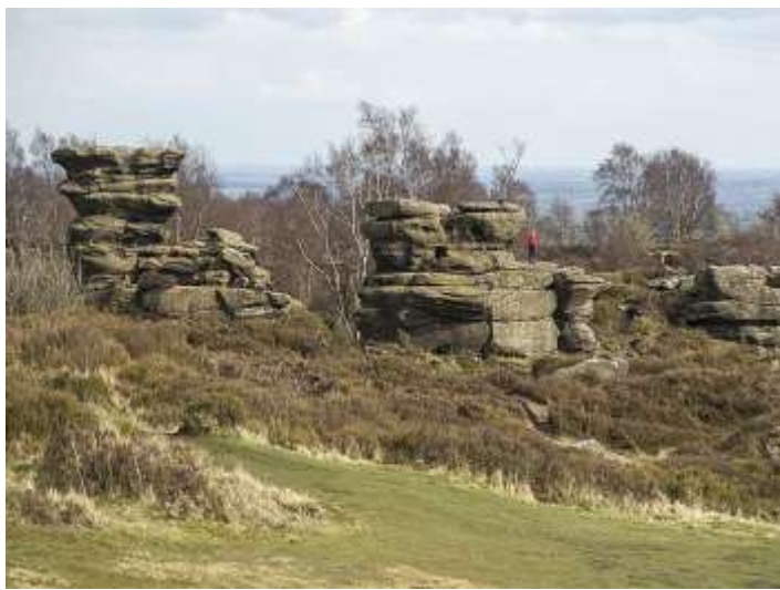
A VIEW OVER THE ROCKS

DRUID'S WRITING DESK OR ET AS IT IS CURRENTLY KNOWN