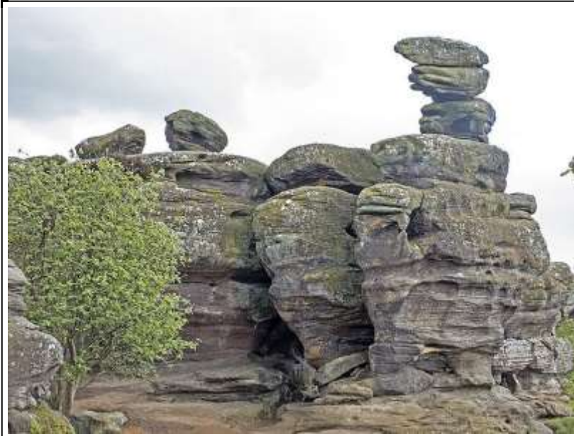
A VIEW OVER THE ROCKS