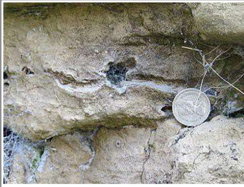
A LONGITUDINAL WORM TUBE

A longitudinal worm tube. Most were end on and many had crystalline edges that reacted. The rocks here were bedded so not an algal mound.